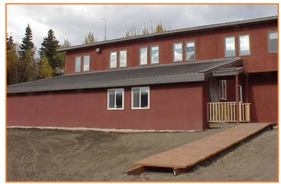
McGrath Museum near completion.