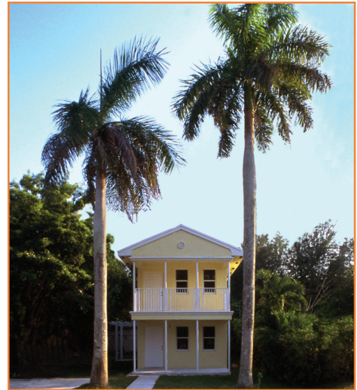
Two-story shotgun house in Thomas Avenue, Coconut Grove, designed by a team of UM architecture students

housing or shotgun homes, and a scale and pattern of development that, if not protected, would be replaced by the type of commercial and residential buildings and density of adjacent developments."