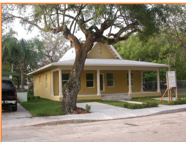
Traditional Southern dogtrot house in Frow Avenue, Coconut Grove

"We selected WCG due to its readiness to work with the university on revitalization efforts and due to its proximity to us," says Shepard. "We saw the neighborhood as worthy of preservation as a historical place in Miami with sixth- and seventh-generation descendants of the original Bahamian settlers still living there. There are vernacular architecture structures typical of worker