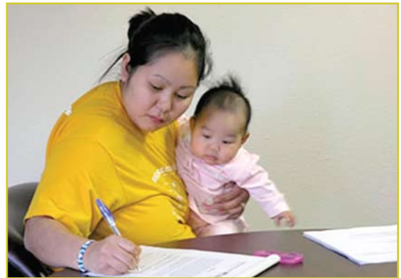
Young mother attends class with her baby