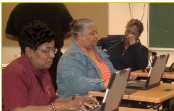
Adult NTHIC participants