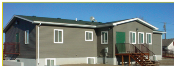
The first of FPCC's new dorms

The new dormitory facilities will allow FPCC to recruit students from outside of the standard 25-mile commuting service area. This is important if the college wants to continue providing educational opportunities to its average population of approximately 400 students.