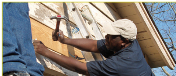
Volunteers engage in renovation efforts

in-kind grants. The city-parish government provided heavy equipment and operators to assist in the initial weed cutting and trash removal for some of the vacant lots and provided paint, equipment, lumber, and technical assistance for some minor home renovation and painting. The Corporation for National Service provided living allowances, some insurance benefits, and training for full-time AmeriCorps VISTA members to assist in capacity-building activities. A grant for $10,000 was received from Allstate Insurance to assist in cleanup and ground preparation for the vacant lot site that will become the community recreational area.