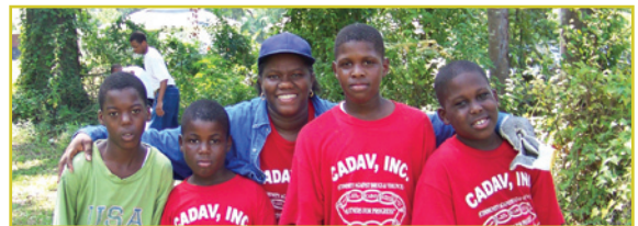
Community Against Drugs and Violence volunteers

“The Adopt-a-Block program appeared to be among the best methods to address residents' concerns of