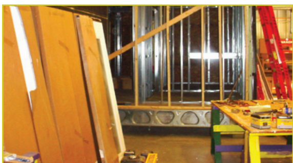
Building dormitories takes place inside FPCC's construction space

To begin construction of its student housing, FPCC applied for and received a $600,000 Tribal Colleges and Universities Program (TCUP) grant sponsored by the U.S. Department of Housing and Urban Development's (HUD's) Office of University Partnerships (OUP). As an element of its TCUP application, FPCC implemented a system to maximize grant dollars by assuming the role of general contractor. This allowed the college to exercise its buying power for materials while providing the college's building trades program students with valuable hands-on construction experience.