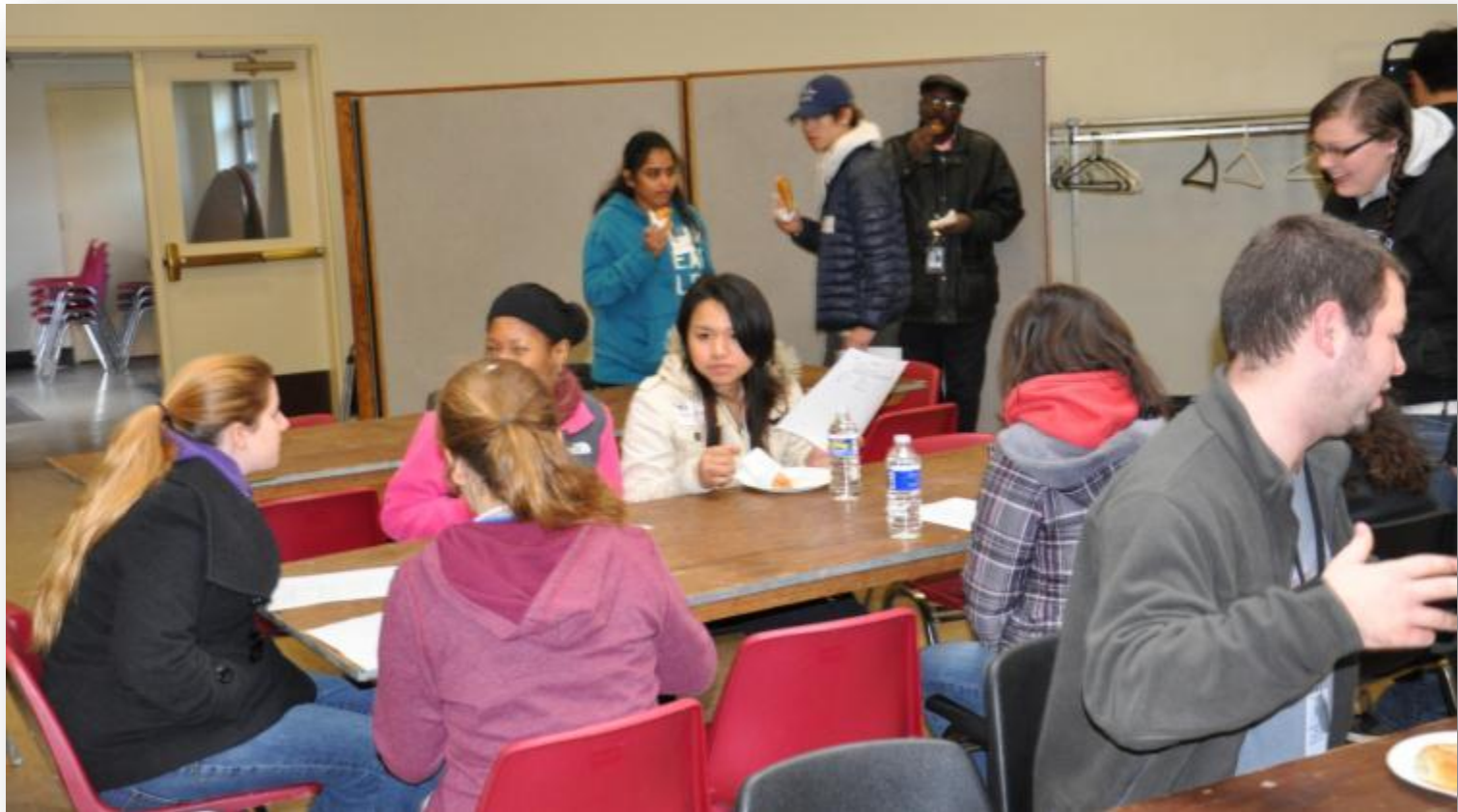
Training Prior to Conducting Surveys