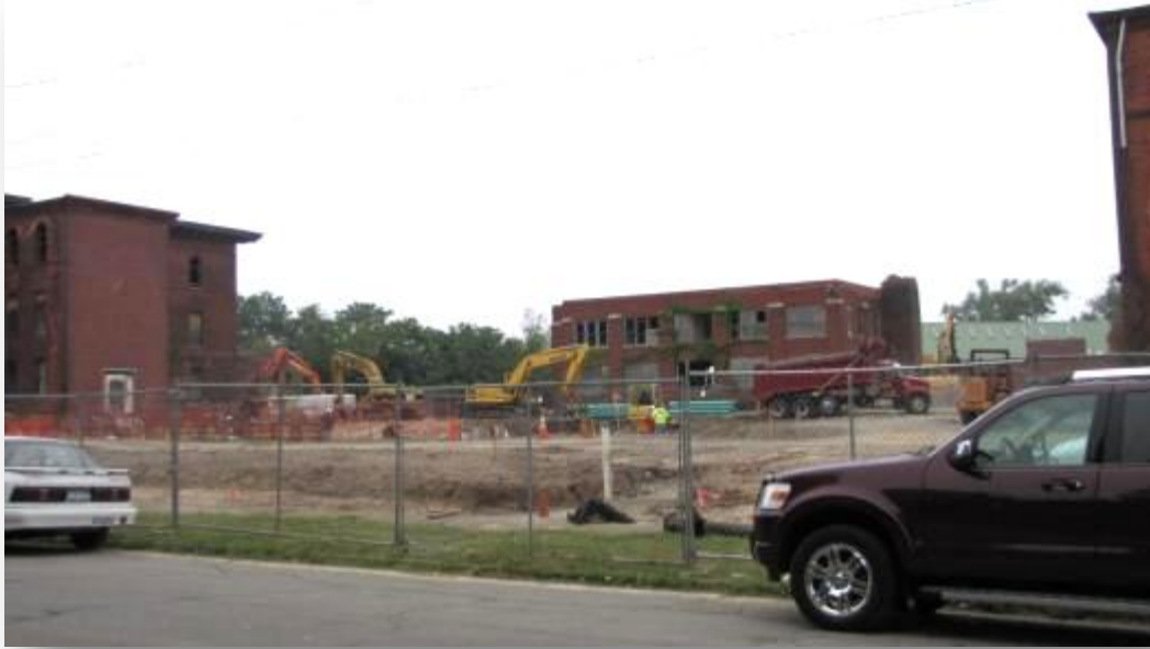
The Affordable Housing Clinic in Action...