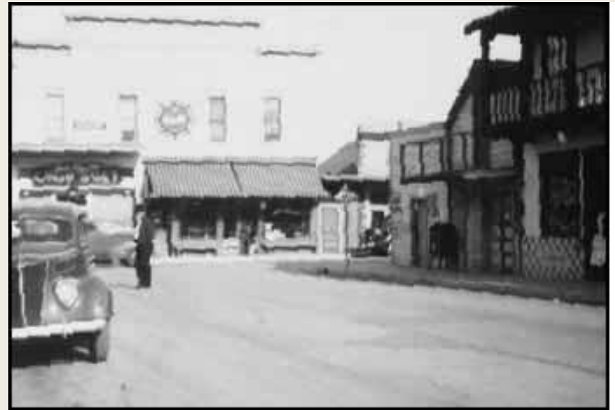
Soledad and Lake in a thriving Chinatown.