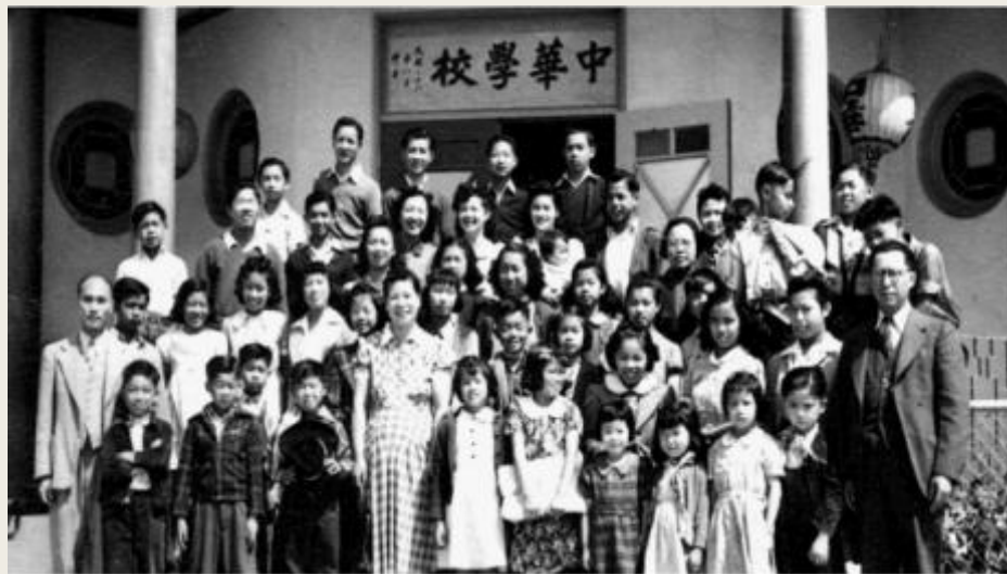
Chinese School 1936