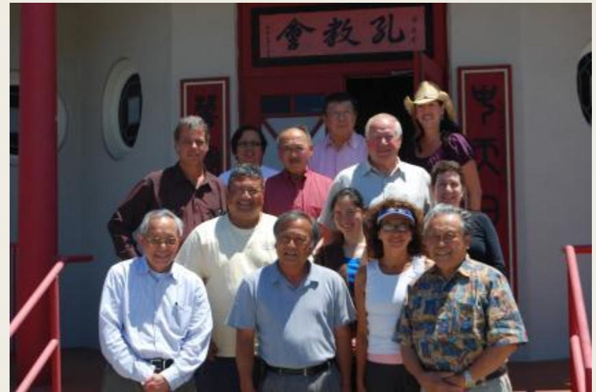
Chinese School 2010