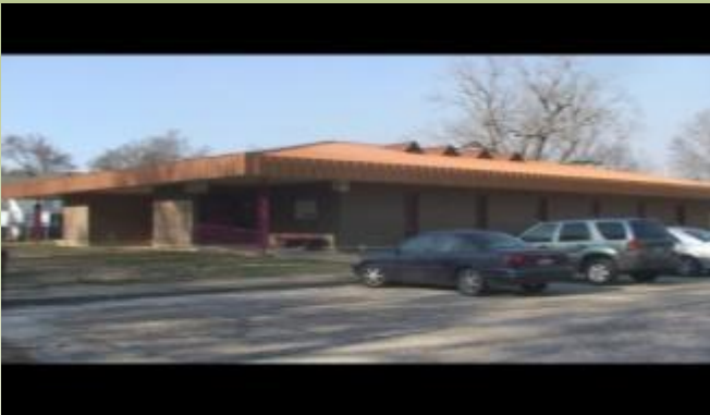
Tuskegee-Macon County Community Development Corporation