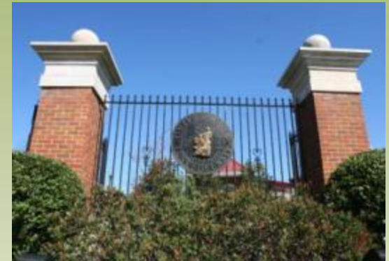
Lincoln Memorial Gates