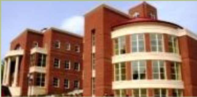
College of Business & Information Center