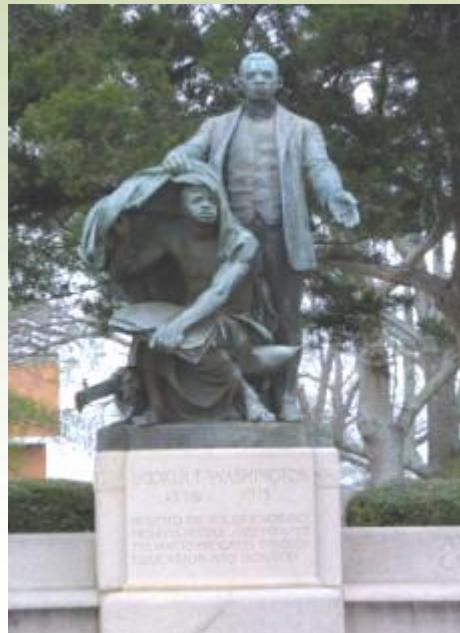
Booker T. Washington Monument