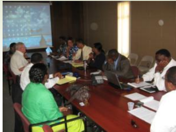
Training - Workshop