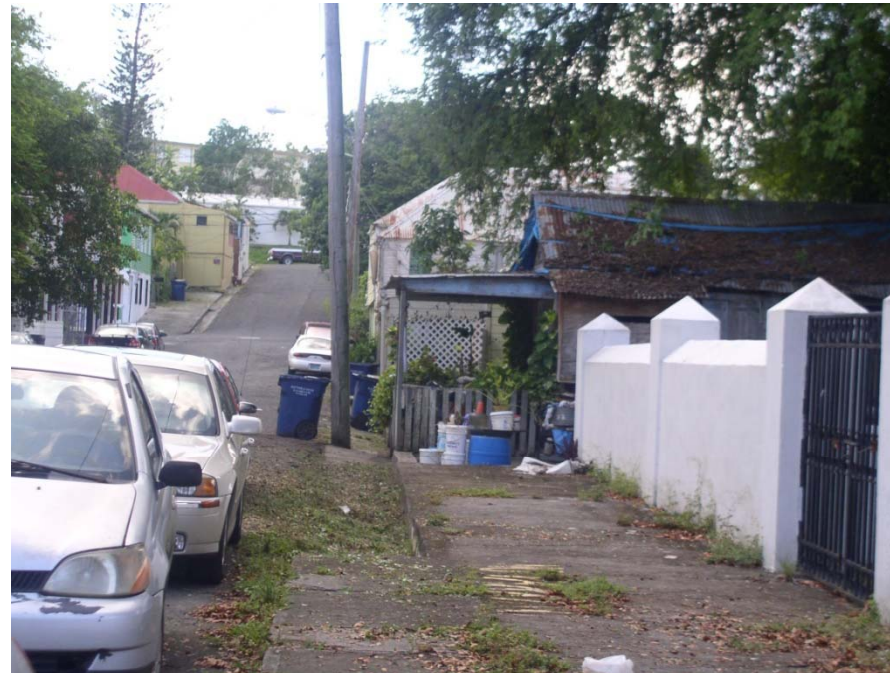
Across the street South