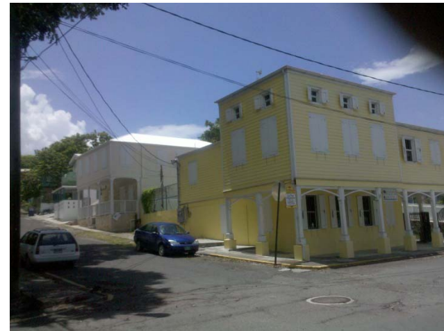
Site in 2007 after restoration