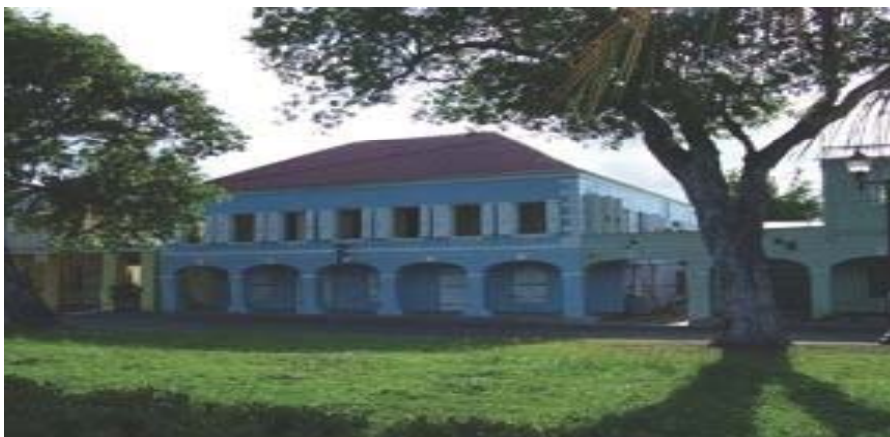
Caribbean Museum Center for the Arts