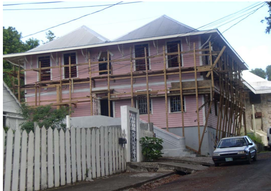
Across the street North