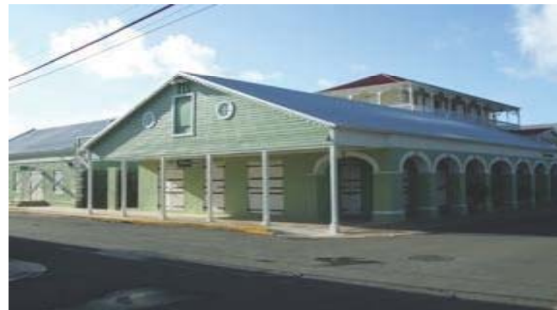
First Bank VI Frederiksted Branch