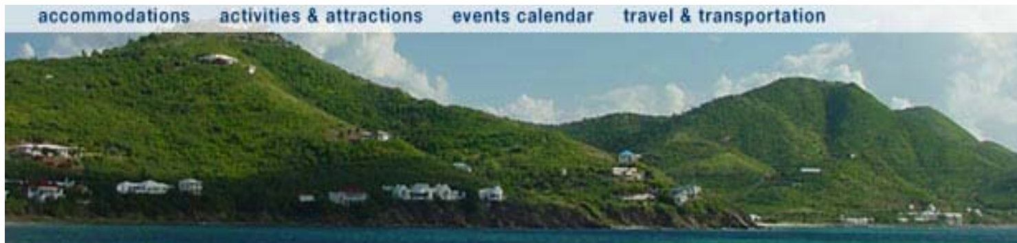
View of Christiansted, St. Croix