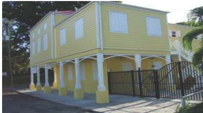
UVI Community Training Center

HISTORICALLY AMERICAN. UNIQUELY CARIBBEAN. GLOBALLY INTERACTIVE.