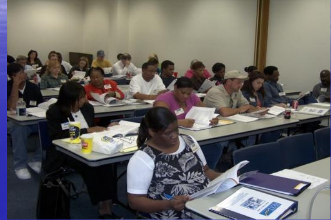
Entrepreneurship class participants