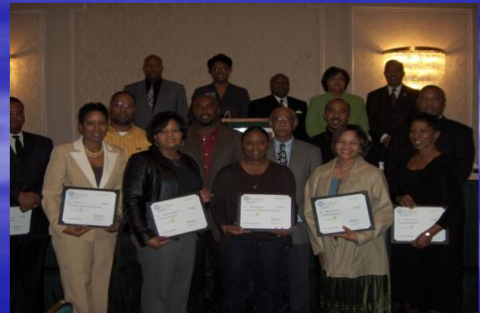
Business Opportunity Grant Recipients