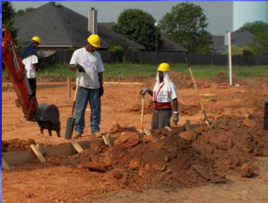
Construction Training Class