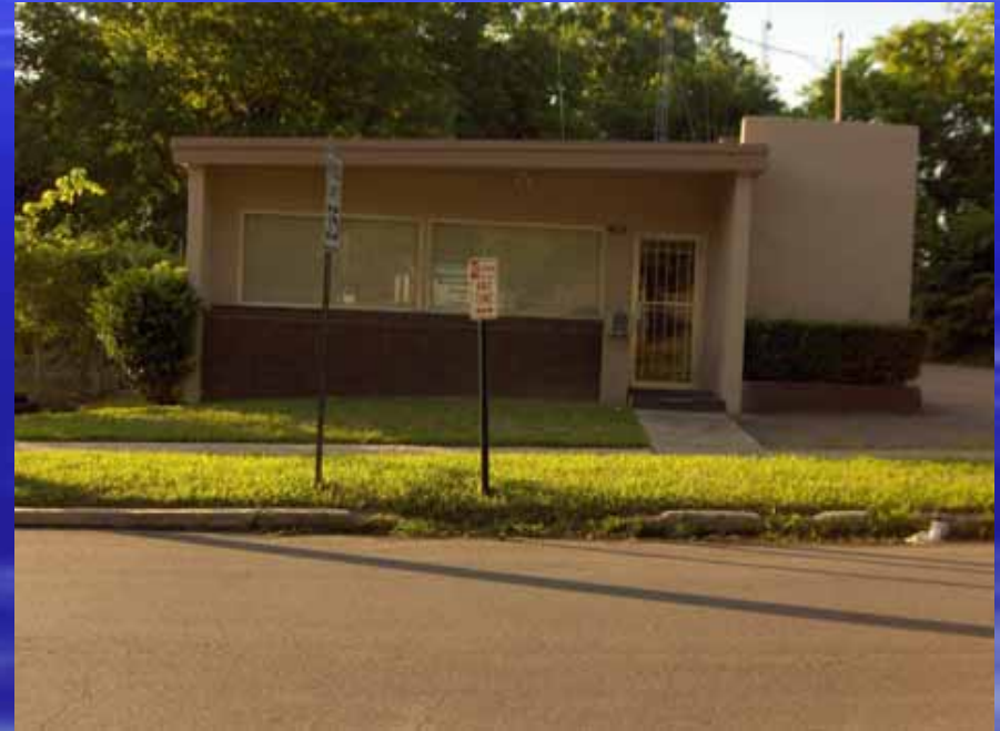
Proposed site for Service Center