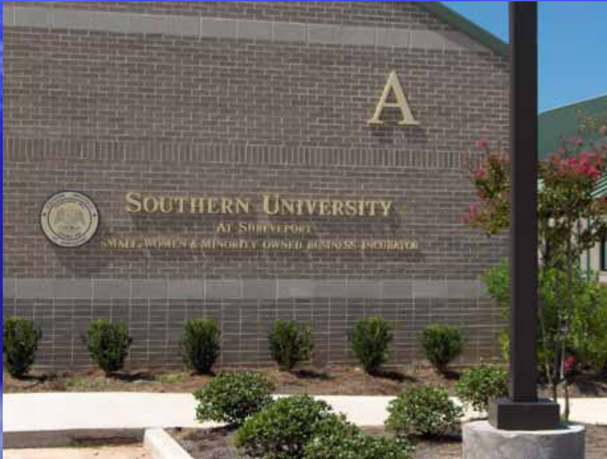
SUSLA'S Business Incubator