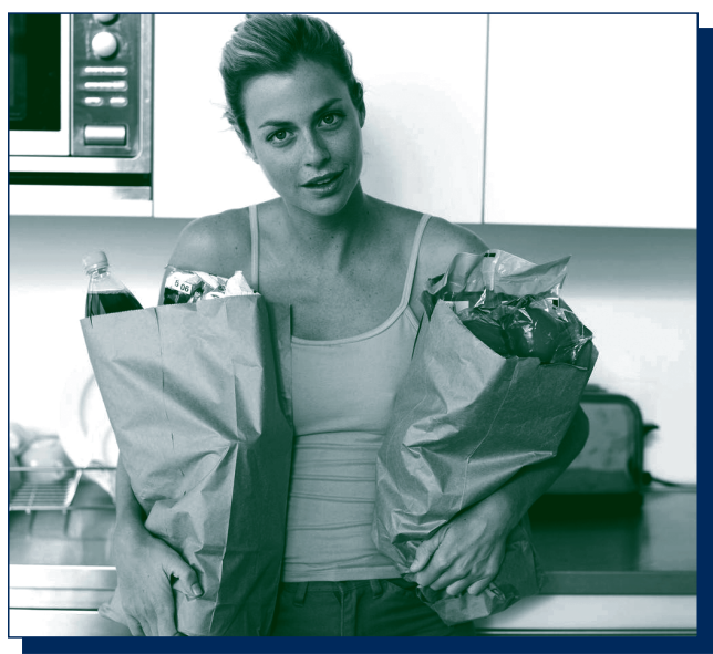
This woman does her housemate/homeowner's grocery shopping in exchange for reduced rent, per their home sharing contract.

The SHC survey found that 75 percent of home providers were women, many of whom own their homes but live on a fixed income at or below poverty level. Elderly homeowners in particular find that renting to a compatible housemate can be a highly satisfactory arrangement that makes fixed incomes