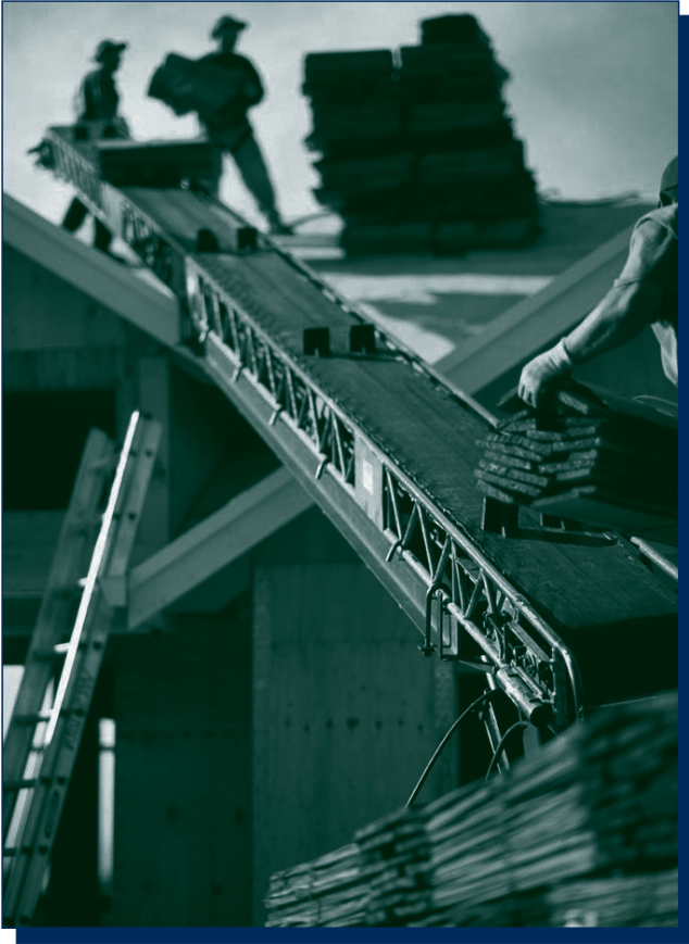
Many NSP1 grantees are acquiring and rehabilitating abandoned or foreclosed homes that will house persons or families with incomes no more than 50 percent of area median income.

Partners, in collaboration with NeighborWorks® America, analyzed a sample of 87 state and local NSP1 action plans. 1 By reviewing these plans (from 22 states, 24 counties, and 41 cities), researchers sought to identify priorities that local communities selected for use in stabilizing their neighborhoods and to aggregate the strategies, financing mechanisms, and program models currently under adoption. Of the planned and eligible activities for NSP1, the dollars are targeted as follows: