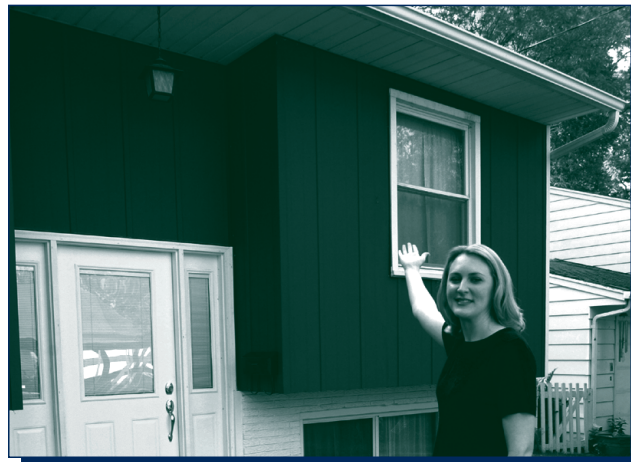
HOME/ADDI downpayment assistance boosted eligible families' transition to homeownership

According to the resulting study, Rates of Foreclosure in HOME and ADDI Programs , such difficulties seem to be the exception, not the rule. 1 This study finds that foreclosure rates among homebuyers assisted through the HOME and ADDI programs were lower when compared with the subprime market and with overall foreclosure rates for buyers with loans insured by the Federal Housing Administration (FHA). Established by the American Dream Downpayment Act of 2003, the ADDI program was funded in fiscal years 2004–2007. ADDI provided assistance with downpayments, closing costs, and rehabilitation associated with a home purchase. ADDI was not subsequently funded because