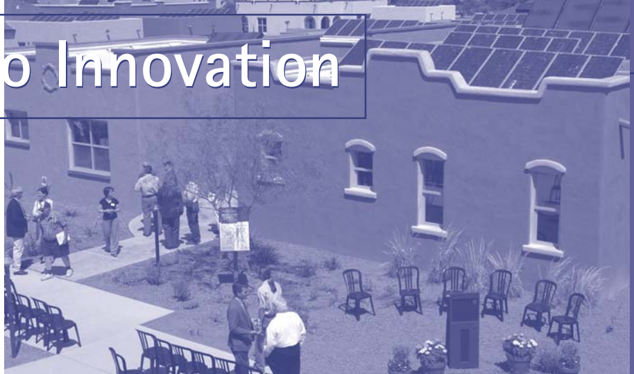
Photovoltaic panels on the rooftops in Armory Park del Sol soak up the Arizona sun in the PATH Zero Energy Home.

Innovative builders come in many shapes and sizes. While large national and regional builders may have the