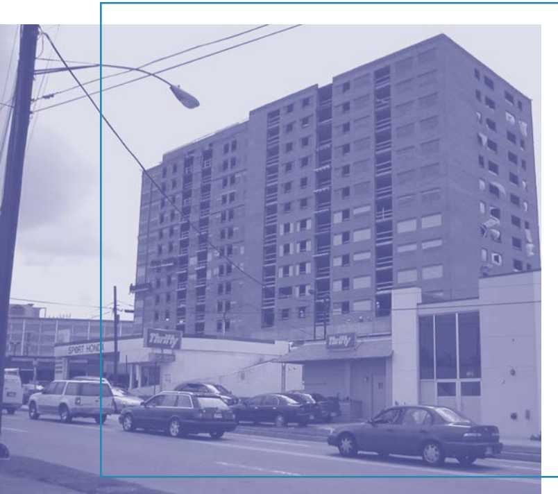
As part of the new Silver Spring development, vacant office buildings have also been renovated for future use.

completed, the County buys back a controlling façade easement from the property owner.