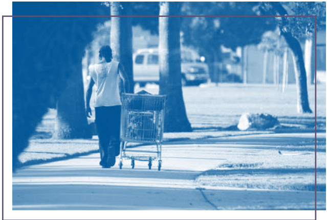
Involuntary leavers of permanent housing often have higher risk profiles and require more supportive services.

In retrospect, leavers of permanent housing who left involuntarily, or who went on to less favorable situations, had higher risk profiles than those leaving of their own accord. As a group, their illnesses were more severe. They functioned less effectively, had a greater rate of substance abuse, and required a higher level of supportive services. Inpatient and emergency psychiatric services were required at a relatively higher rate, suggesting that the illnesses of these individuals may have worsened.