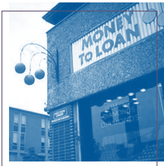
Pawnshops are just one of many AFSPs found in some minority and low-income neighborhoods.