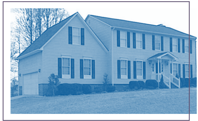
Public support for fair housing increased from 66% in 2000–2001 to 73% in 2005.