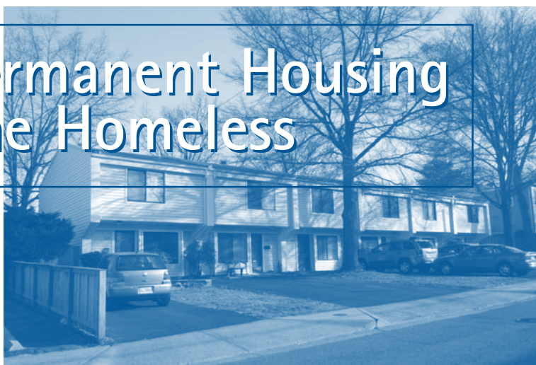
Permanent housing, combined with supportive services, can help homeless individuals live independently and safely.

According to the U.S. Department of Health and Human Services, over 600,000 adults are homeless in an average week. Since the passage of the Stewart B. McKinney Homeless Assistance Act of 1990, however, the problem of chronic homelessness has been systematically attacked on many fronts. Permanent housing, in which there's no limit on length-of-stay, is a significant component of HUD's overall effort to combat homelessness. Combined with supportive services, permanent housing offers homeless people—especially those with disabilities—a chance to live independently and safely in their own homes.