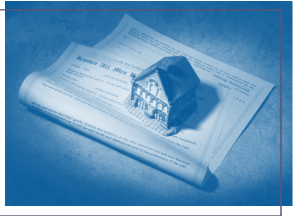
Subprime lending can result in higher rates of foreclosure on home loans and undermine a community's economic stability.

HUD recently released an exploratory study of the extent to which neighborhood ethnic and racial characteristics, income levels, and credit-risk measures are related to the incidence of subprime mortgage lending, and to the physical location of AFSPs and banks. The study, Subprime Lending and Alternative Financial Service Providers: a Literature Review and Empirical Analysis , exhaustively reviews the research literature concerning subprime lending and its relationship to low-income and minority neighborhoods; AFSPs and