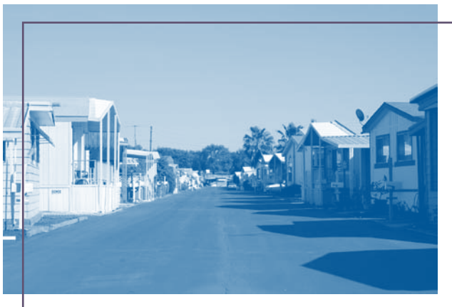
Increasing rents and rising prices for stick-built houses make manufactured housing an increasingly affordable option.

The question, then, is whether manufactured housing constitutes a good alternative for low-income families? To explore the possibility, HUD commissioned a team of researchers who used AHS data from 1993 to 2001 to compare three residential options: rental housing, owned manufactured housing, and owned stick-built housing. The research team compared these housing options along several dimensions, including structural quality, neighborhood characteristics, cost, affordability, and price appreciation. The researchers used the responses of a subsample of AHS participants from low-income households who were at or below 80 percent of the median income.