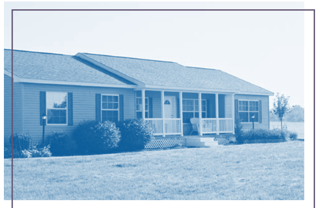
Manufactured homes can provide an affordable alternative for low-income families.