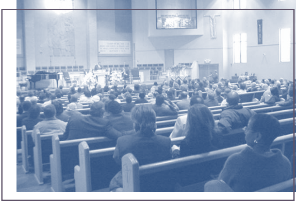
Faith-based groups meet in Nashville, Tennessee to promote affordable housing and minority homeownership.

presents the results of that review and analysis. View and download the PDF file (1375 KB) at http://www.huduser.org/publications/commdev/lessons_complete.html .