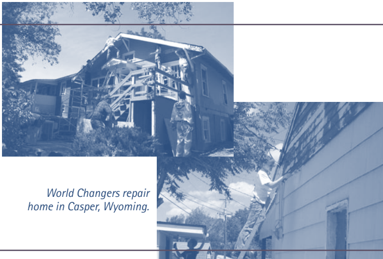
World Changers repair home in Casper, Wyoming.

Lessons Learned From the Community Outreach Partnership Centers Program (March 2002, 144 p.). In 1994, HUD launched the Community Outreach Partnership Center (COPC) program to foster and support collaborations between institutions of higher education and their communities. COPC is HUD's primary vehicle for engaging colleges and universities in community development. HUD commissioned Lessons Learned from the Community Outreach Partnership Centers Program to review the experience of a sample of early COPC grantees in order to distill lessons about the challenges and contributions of campus-community partnerships, and to determine how community outreach efforts like those supported by COPC are being institutionalized by colleges and universities across the country. This report, based on the experiences of 25 COPC grantees and their partners,