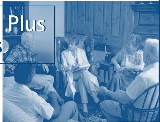
Affordable housing plus services enables older residents of subsidized multiunit properties to age in place rather than moving into a nursing home.

As America's senior population continues to grow, the need for new models of delivering health-related and supportive services that are both attractive and affordable to low- and modest-income older adults is increasingly clear. Although assisted living is a relatively popular alternative to nursing homes, it remains too expensive for many seniors with limited incomes. Aware that an established relationship exists among age, chronic illness and disability, and long-term health care needs, policymakers are seeking additional options for seniors.