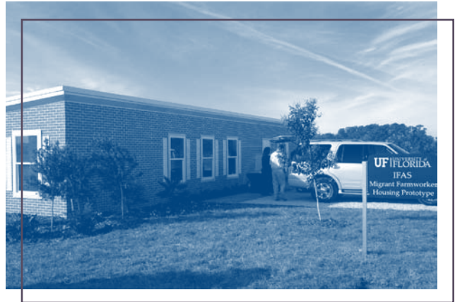
The Migrant Worker Prototype House was constructed and finished in five weeks.