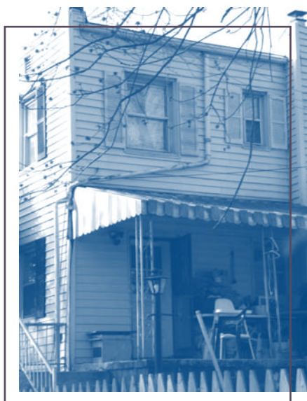
Recipients reported that vouchers helped stabilize their housing situation.