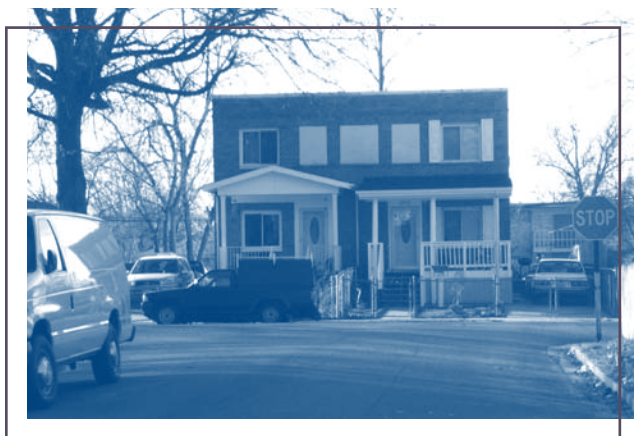
Vouchers enable users to make small improvements in their home neighborhoods.

Voucher users were able to make small improvements in their home neighborhoods. Families who used vouchers to move reported feeling safer in their new surroundings, although they remained dissatisfied with