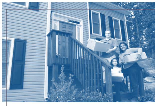
Homes sold under the 602 Nonprofit Disposition Program provide affordable housing and help to stabilize neighborhoods.

ACAs stand to benefit from the 602 Program, in that the rehabilitated homes are expected to revitalize and stabilize neighborhoods, while reducing the number of foreclosures in the area. Prospective homebuyers benefit by being able to obtain affordable housing