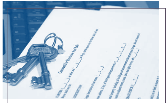
The 602 Program opens doors to affordable homeownership for low- and moderate-income individuals and families.

Optimal Solutions Group, LLC and Abt Associates, Inc. have jointly worked on a strategy that HUD can use to evaluate the 602 Program. They visited three of seven program sites operational in June 2005 to discover how participating agencies were implementing their projects and to develop recommendations for a