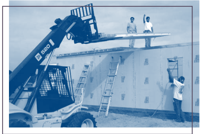
Installation of SIPs requires fewer construction workers than traditional construction methods.