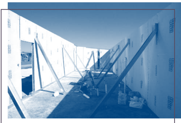
Structural insulated panels (SIPs) are energy-efficient, mold- and mildew-resistant, and can withstand Category 4 hurricane winds.