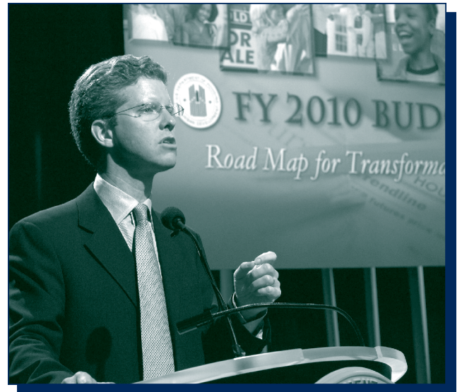
HUD Secretary Donovan introduces plans for building sound housing policy.

In 2007, the total amount of funds obligated for... external research was one-third of what it had been in 1999 ($14.8 million compared with $43.5 million). For a department that spends more than $36 billion of taxpayer money each year on a variety of housing and community development programs, there is virtually no money available to the one quasi-independent office in the agency charged with evaluating how these program funds are spent, assessing their impact,