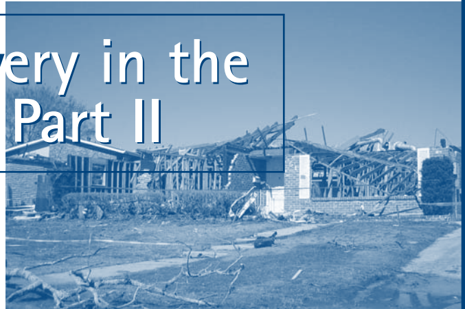
HUD's research provided detailed information on the extent and location of hurricane damage in the Gulf Coast.

Although it has been over a year since three powerful hurricanes – Katrina, Rita, and Wilma – slammed into the Gulf Coast, their effects still linger. According to a HUD analysis, the storms damaged more than 1.2 million housing units in Louisiana, Texas, Mississippi, Florida, and Alabama, and in 25 percent of these homes, the damage sustained was major or severe. This article, the second of two installments about HUD's role in hurricane recovery in the Gulf, details the innovative process HUD used in the summer of 2006 to allocate $5.2 billion in supplemental recovery funds. (The December 2005 allocation of $11.5 billion was discussed in Part I of this article, which appeared in the October issue of ResearchWorks .)