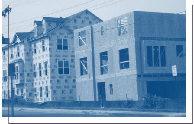
CMARs can help predict demand for new housing nationwide.

new housing units in Reno brought about by significant immigration since the 2000 census.