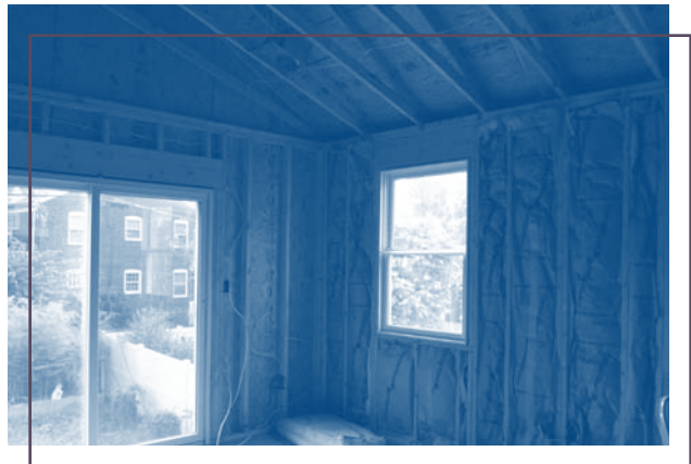
CMARs help localities maintain a balance between housing demand and supply.

Oshkosh is 7,150 units, a slight increase over the annual average rate of new sale units since 2000.