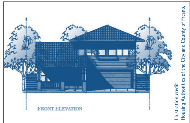
Yosemite Village will provide mixed-income housing for 168 families in Fresno, California.

The vision driving change for the Central San Joaquin Valley is that of a thriving, safe community that offers a variety of affordable housing opportunities for all