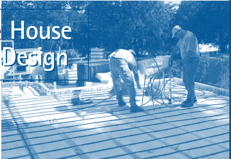
Workers connect a radiant floor heating system in the Paterson Showhouse.

This summer, in Paterson, New Jersey, ground was broken for a 2,900-square-foot, three-story demonstration house that combines some of the best building practices, materials, and technologies available to homeowners today. Many affordable housing technologies evaluated by the Partnership for Advancing Technology in Housing (PATH) will be demonstrated. The project is part of a global "Better Home, Better Planet Initiative" launched by BASF-The Chemical Company, which seeks to "...offer real-life solutions for builders, architects and homeowners that are mindful of the environment." Although BASF is spearheading the project, over 50 companies and organizations are contributing products, materials, technologies, and time.