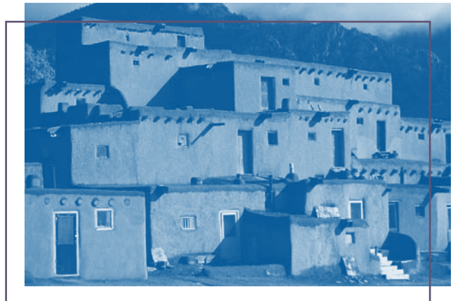
Adobe houses are well-suited to the climate of the Southwest.

Southwest Housing Traditions presents examples of traditional housing from the Native American, Hispanic, and Anglo cultures of the Southwest. Numerous photographs and diagrams of adobe row houses, Anglo bungalows, adobe houses with L-shaped and U-shaped courtyards, and zaguán houses, which feature a central entry hall/breezeway that connects the street to the patio at the interior of the house, illustrate housing that's been adapted to suit both climate and geography. The study describes how adobe walls store heat during the day and release it at night, how patios and vegetation can help cool a house, and