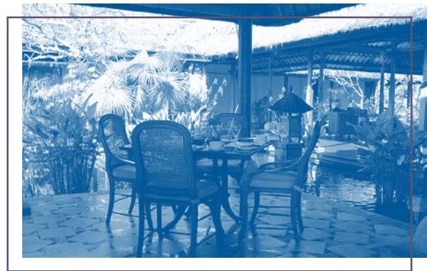
Plants provide shade and humidity to the patio.