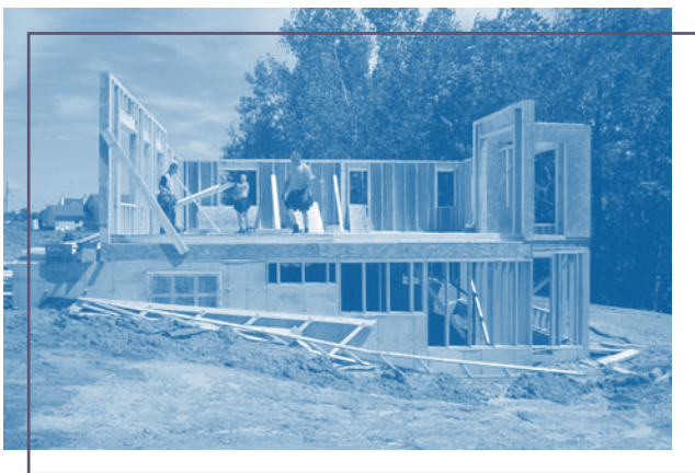
Structural insulated panels (SIPs) form the second floor of the Paterson Showhouse.

Beyond the building envelope, the Paterson Showhouse features a number of other smart building techniques and technologies. For instance, it incorporates Zero Energy Housing (ZEH) concepts developed by the Oak Ridge National Laboratory. A zero-energy home uses solar panels and other alternative energy sources to generate as much energy as it consumes. As a result, the home draws no energy from the power grid, and in some cases, can even feed electricity back into the grid. This turns the home's electric meter backward,