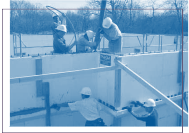
Insulating concrete forms (ICFs) in the basement walls provide thermal insulation.

a condition known as 'net metering.' The Paterson Showhouse has a solar energy system that not only generates electricity, but is also integrated with the home's domestic hot water and heating systems for maximum efficiency. The system is architecturally integrated into a cool metal roof.