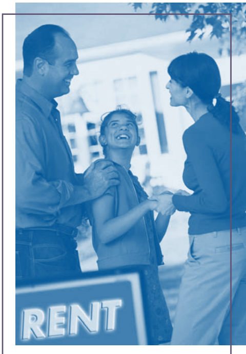
Web-based housing services can help families find affordable housing more quickly.

When an owner wishes to list a property, a choice of pertinent tools and information is immediately available to the potential landlord. There is a flow chart depicting the tenant-based Section 8 housing process, a chart that displays listing limits for rentals and homes for sale, information about housing quality standards, and links to other housing information, including HUD websites (for information on Fair Market Rents, the Housing Choice Voucher Program, and public housing assistance, with a direct link to information specific to Colorado). Last but not least, the steps necessary to list a property are described.