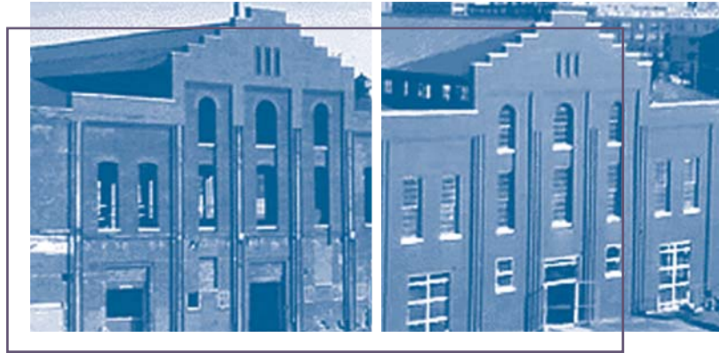
An old factory building is transformed into a new, usable facility thanks to a BEDI grant from HUD.

There are a few fairly straightforward criteria to consider. BEDI funding must be received and used in conjunction with HUD Section 108 loan guarantee funding. Section 108 is the loan guarantee provision of the Community Development Block Grant (CDBG) program. Section 108 provides communities with a source of financing for economic development, housing rehabilitation, public facilities, and large-scale physical development projects. BEDI funds may be used for any eligible activities covered under the Section 108 Loan Guarantee program. Any community that is eligible to receive Section 108 loan guarantees - whether they are a CDBG entitlement community or not - is eligible to apply for BEDI funds. Each BEDI application must be accompanied by a request for new Section 108 loan