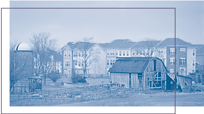
Old world meets new world: New housing development abutting an old barn in Loudon County, VA exemplifies the stress felt in rapidly developing communities across the country.

To make this information readily accessible to the broadest possible audience, we've created the Regulatory Barriers Clearinghouse Web site at www.regbarriers.org ; a portal site of www.HUDUSER.org . The site contains an electronic database, an online newsletter, links to relevant publications, and a simple, straightforward means of submitting viable strategies and experiences. Our bimonthly electronic newsletter, Breakthroughs , features real-world success stories on how various communities are effectively addressing regulatory concerns. We also respond to telephone calls (1-800-245-2691, option 4) and emails as part of our